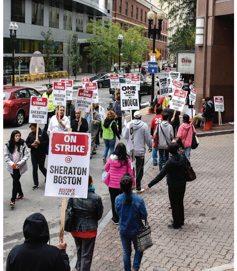
More than 1,500 Marriott employees went on strike Wednesday.