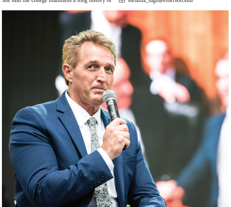
Sen. Jeff Flake spoke at the Forbes Under 30 Summit at City Hall Plaza on Monday.