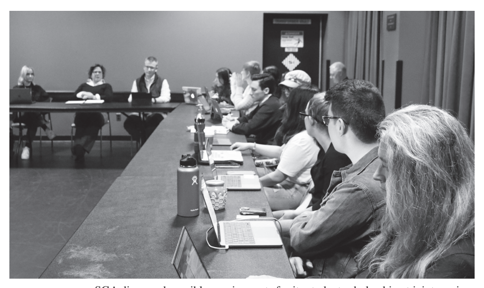
SGA discussed possible requirements for its student scholarship at joint session.

SGA voted to allocate $25,000 of leftover money to this scholarship fund last year. They use the money in the scholarship account, called