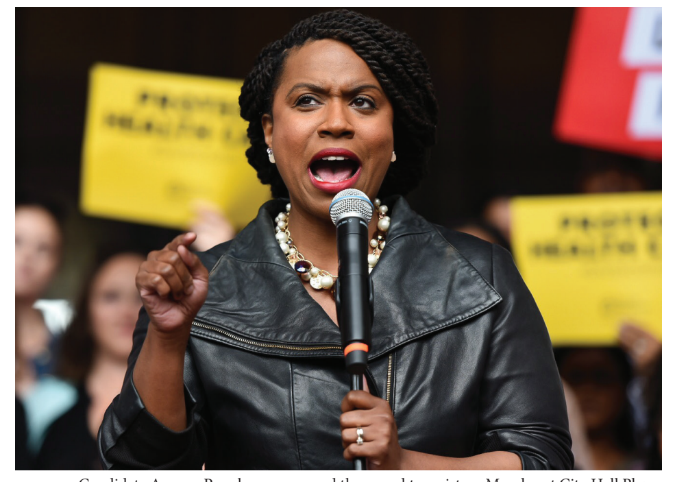
Candidate Ayanna Pressley encouraged the crowd to resist on Monday at City Hall Plaza.