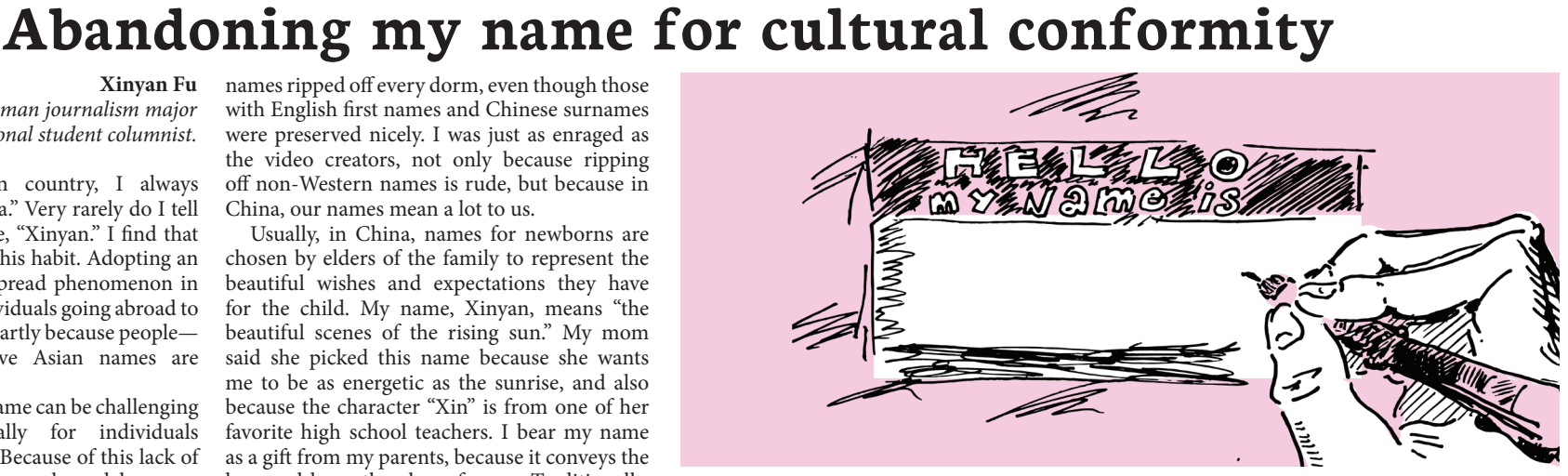
Even though I enjoy my English name, I've always felt that it is just an identification code no different than my student ID number. • Illustration by Ally Rzesa / Beacon Staff

Therefore, even though I enjoy my English name, I've always felt that it is just an identification code no different than my student ID number. I choose "Eliza" from my favorite character in my favorite book, "Pride And Prejudice." It wasn't my first English name. Just like people buy new clothes to replace old ones,