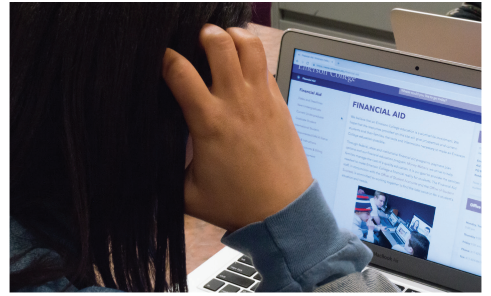
I told myself that I would go to Emerson by applying for scholarships day and night.