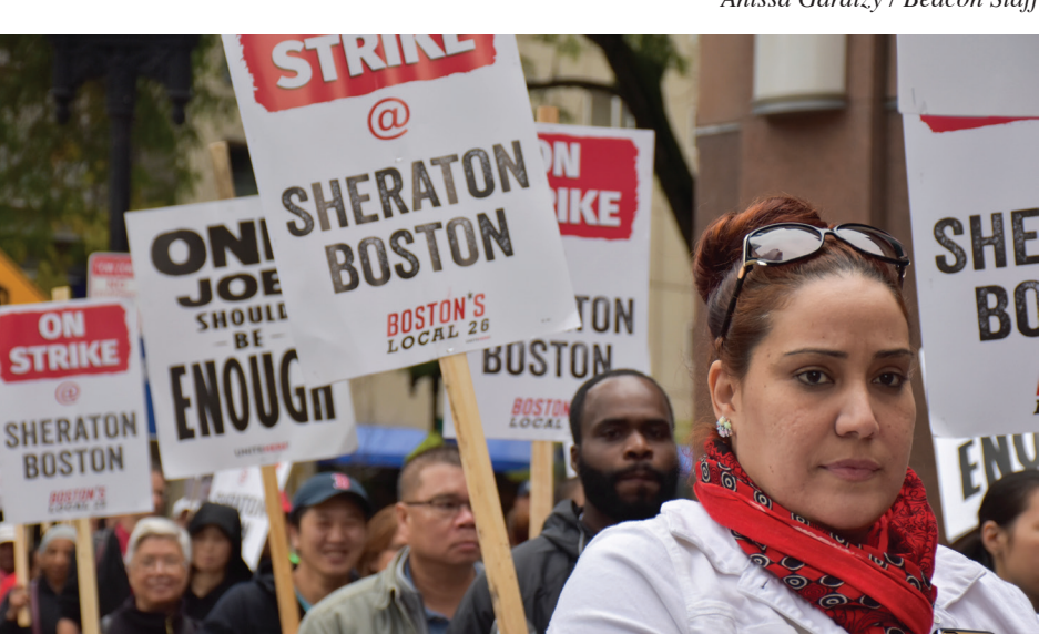
Seven simultaneous strikes occurred at Marriott Hotels starting at 6 a.m Wednesday.