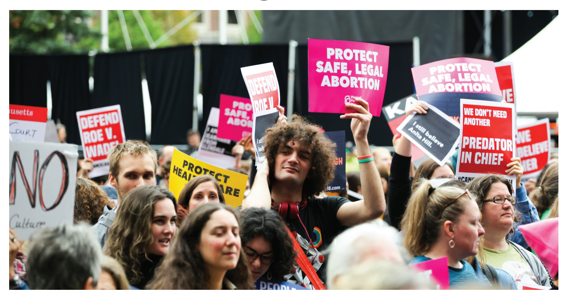
A sign at the protest read "We don't need another predator in chief," and another read, "Protect, safe, legal abortion."